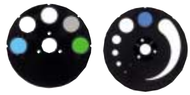
VARIOUS KINDS OF BUILT-IN FILTERS: COBALT BLUE, RED-FREE, 50%ND AND HEAT ABSORPTION FILTERS