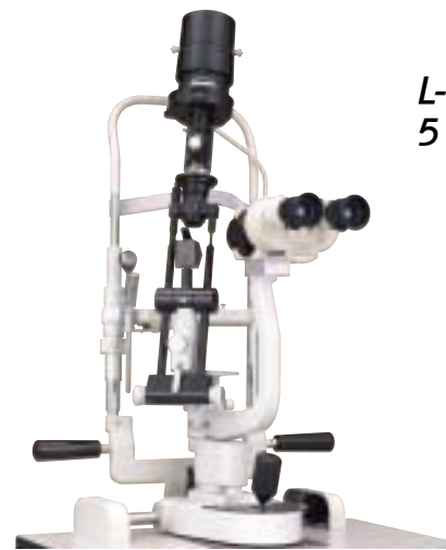
L-0189 5 STEPS MAGNIFICATION SLIT LAMP