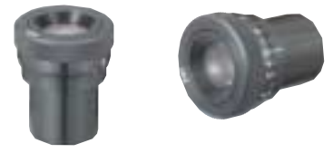
OCL-009 EYE PIECES 15X