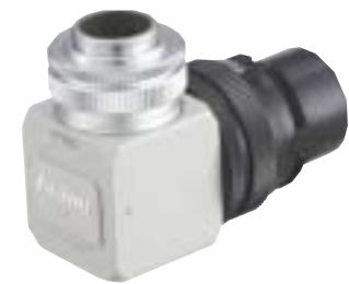
L-0544 TV CAMERA ADAPTOR(f=100mm)