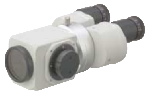
MS-51 3 STEPS MAGNIFICATION SYSTEM (10, 16, 25X, OBJECTIVE LENS f=100mm)

The L-0187 3 STEPS MAGNIFICATION SLIT LAMP provides practitioners with the utmost satisfaction thanks to its excellent image clearness and fine design.