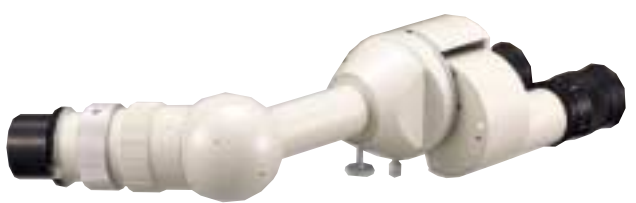
L-0542-C ASSISTANT BINOCULAR MICROSCOPE