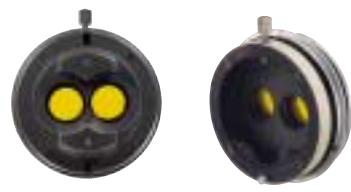
YF-57 SPECIAL ADAPTOR BUILT-IN YELLOW FILTER