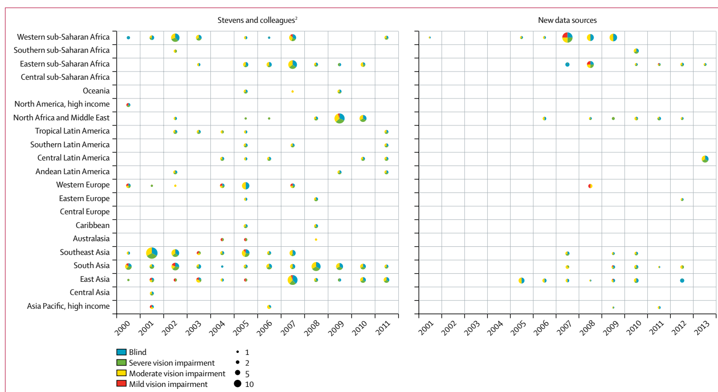
Figure 1: Population-based prevalence studies of blindness and vision impairment in the Global Vision Database

Volume of new studies by region and reporting by vision loss severity are presented with a comparison to those in the original systematic review. 8 New studies were obtained from Afghanistan, Bhutan, Burundi, China, Egypt, Eritrea, Ethiopia, Ghana, Honduras, India, Iran, Jordan, Kenya, Laos, Libya, Madagascar, Moldova, Mozambique, Nepal, Nigeria, Norway, Panama, Saudi Arabia, South Africa, South Korea, Taiwan, Tanzania, Timor-Leste, Turkey, Uganda, Vietnam, and Zambia. Black bubbles indicate the number of studies.